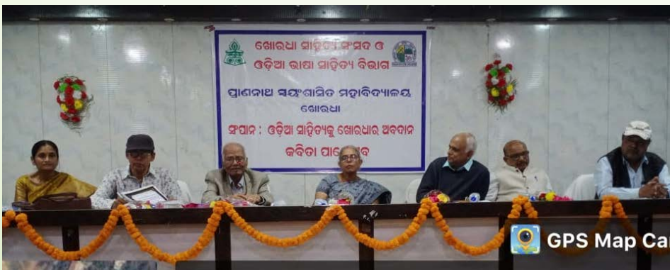
GPS Map Car