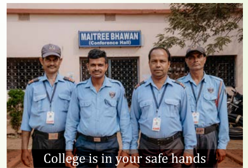
College is in your safe hands