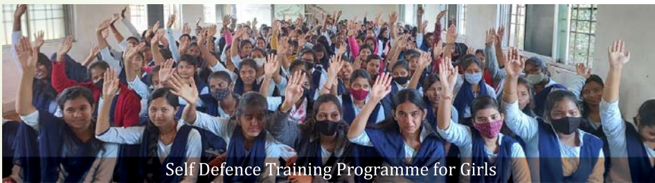
Self Defence Training Programme for Girls