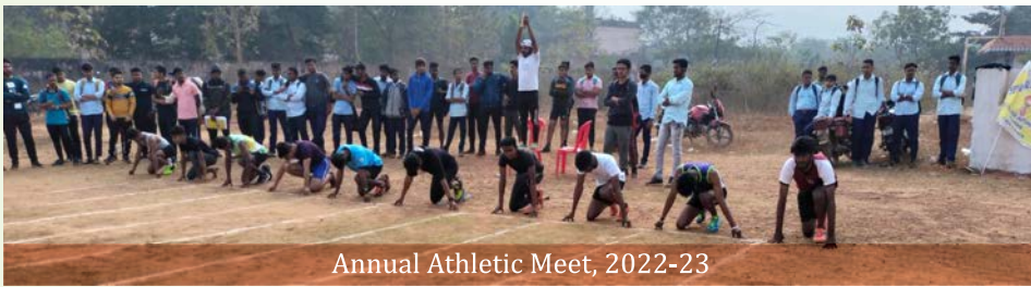
Annual Athletic Meet, 2022-23