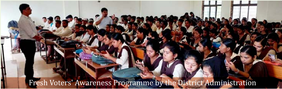
Fresh Voters' Awareness Programme by the District Administration