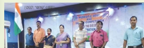
ଓଡ଼ିଶା ବିଳାସୀ ପୁରାତନ ଗୀତଗୋବିନ୍ଦ ଗୀତା ଓ ବେଞ୍ଚାନ୍ତରାଜ୍ୟ ଗୀତା ପ୍ରତିଯୋଗିତା ଅବସରରେ ଗଢ଼ିତ ଅଛି।

Various competitions were organised among the students to commemorate "Odisha's contribution to the Freedom Struggle and influence of Mahatma Gandhi" from 20 th to 27 th September, 2022.