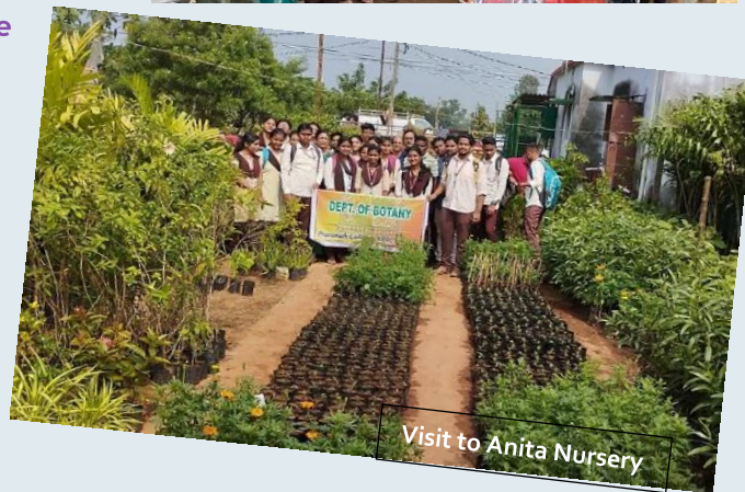
Visit to Anita Nursery