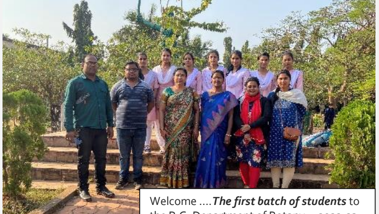
Welcome .... The first batch of students to the P.G. Department of Botany....2022-23